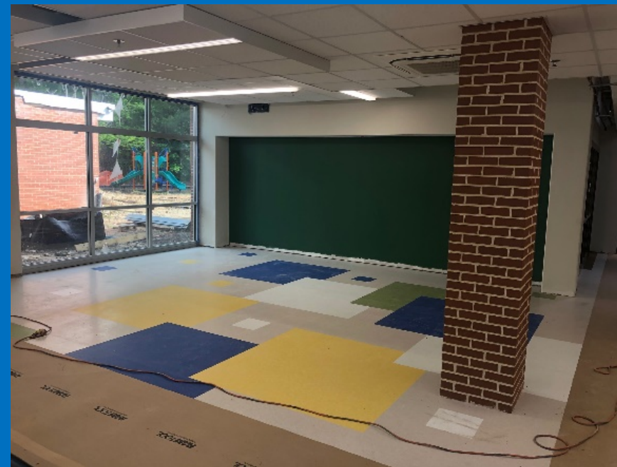
Renovation Main Lobby