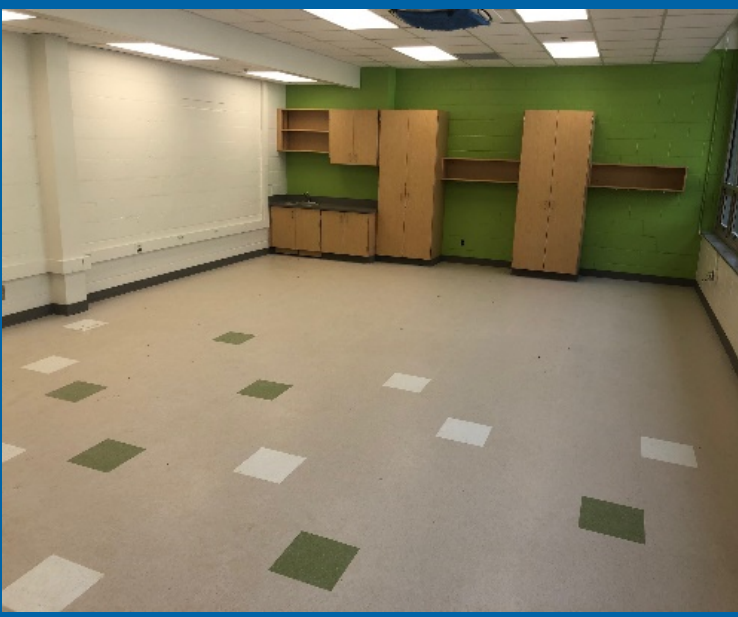
SW Wing Classroom VCT and Base