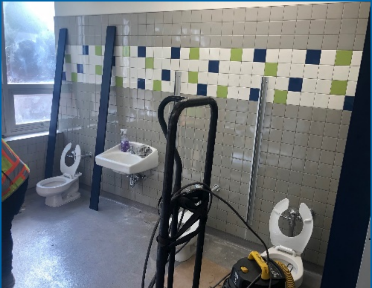
Toilet Partition Installation Starting