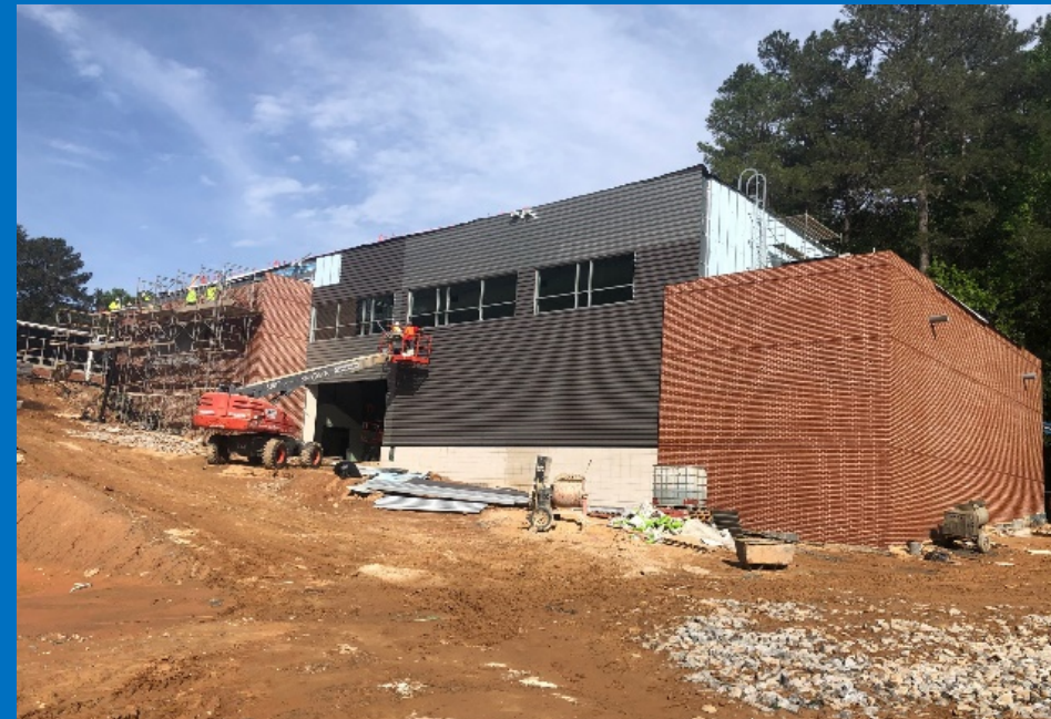
Gymnasium Northeast Elevation Progress