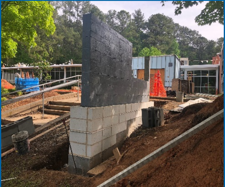
New Monument Sign Installation