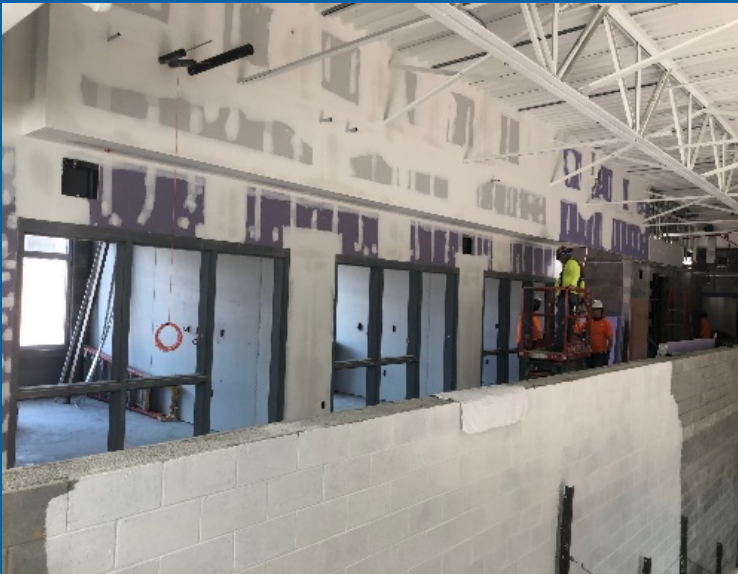
Gymnasium Mezzanine Drywall Finishing